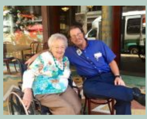
Clifton's Cafeteria was wonderful!