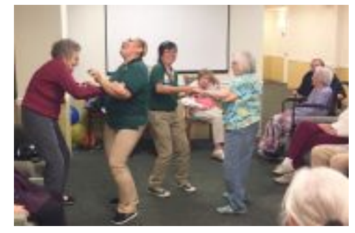
An impromptu dance party in the Neighborhood? Why not?!