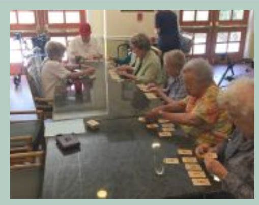
Very focused during Scrabble Slam