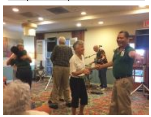
Our weekly Wine and Cheese Happy Hour remains a resident favorite. Join us Thursdays at 3:30pm for live entertainment and bring your dancing shoes...just in case!

August 2nd 4pm - 6pm Dinner 6:30pm - 7:30pm Entertainment