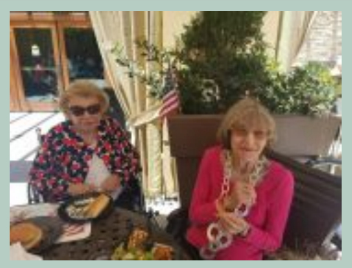
4th of July BBQ