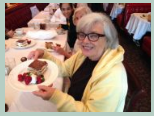
Sandy's amazing dessert at La Scala