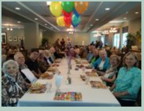
Resident Birthday Party