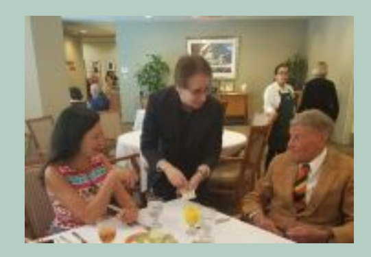
Father's Day Magic