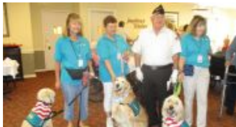
Rainbow Therapy Dogs were present and greeted all our veterans!