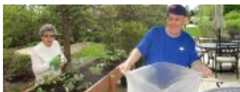
Bart was helpful cleaning up!