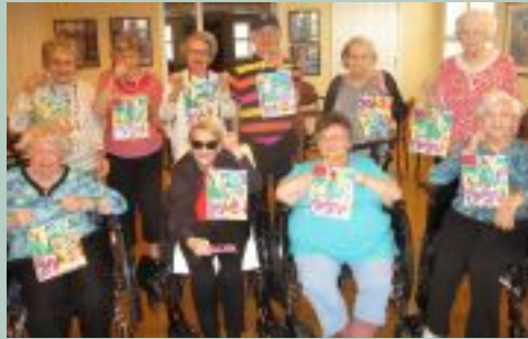
You can see these works of art hanging on the residents' doors!