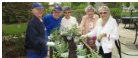
Our Belmont planters!

Several residents planted flowers in the back patio pots and herbs and vegetables in our raised garden bed. Much love and talent went into our gardens! It sure makes sitting outdoors more pleasant and the kitchen uses the herbs and vegetables in their recipes!