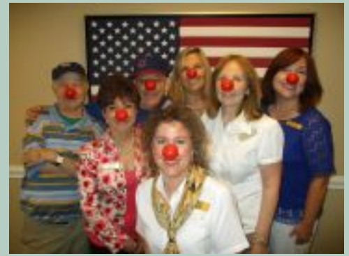
We supported "Red Nose Day!!"