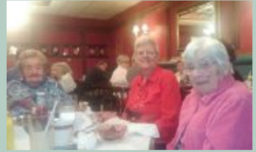
Circle of Friends had a great time at The Silver Caboose!