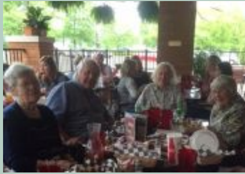
Having lunch on the patio at Huey's.