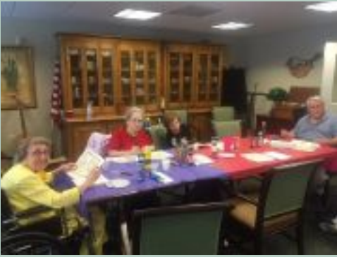
Painting blooming flowers!