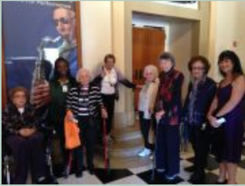
Romeo & Juliet Ballet Outing