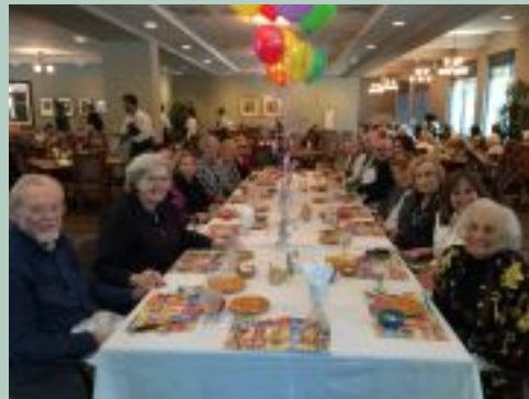
Resident Monthly Birthday Party