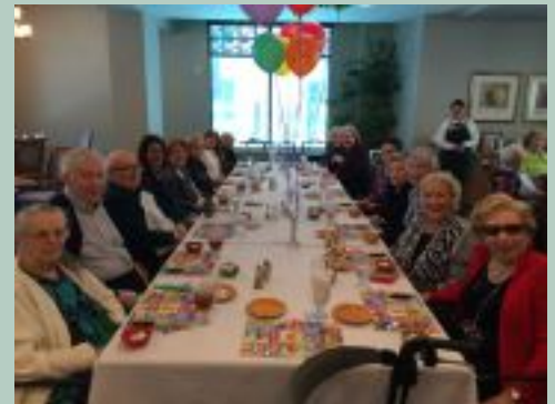
Birthday Party guests