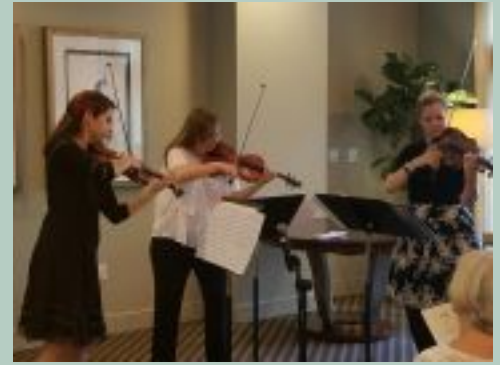
Mandell Collection Recital