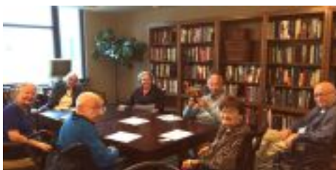
Residents participating in "What's the Verdict?" court case review.