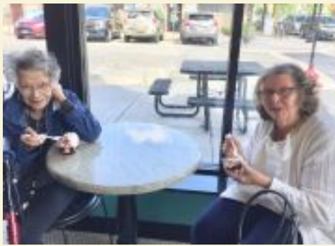
Petersen's Ice Cream!