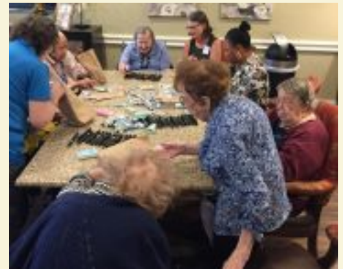
Making gift bags for First Responders