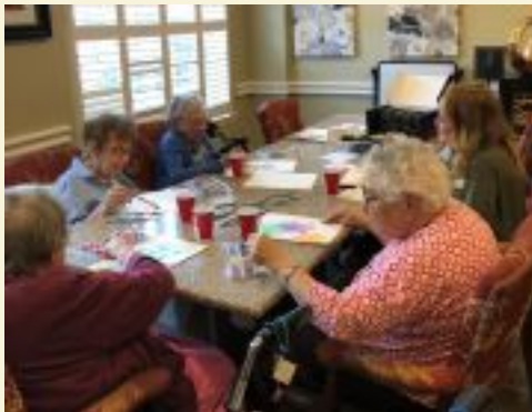
Watercolor painting with APC Leanna