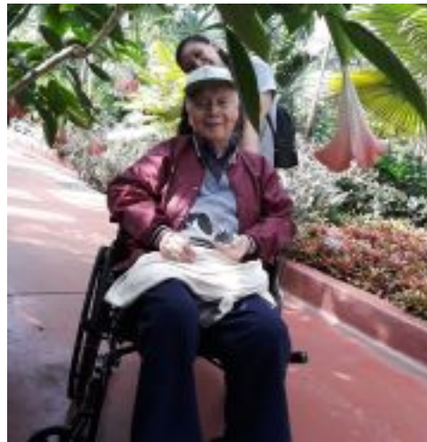
This summer, we visited Garfield Park Conservatory two times. What a beautiful place for a walk!