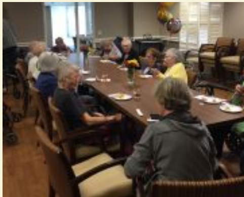
Monthly New Resident Tea!