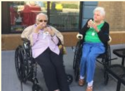
Petersen's Ice Cream!