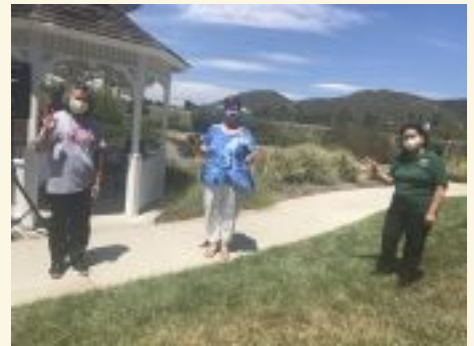
Noon Rotary Club of Rancho Bernardo presents gift cards in appreciation to nurses and PALS