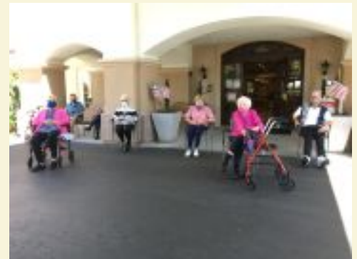
Enjoying the live entertainment and the summer breeze!