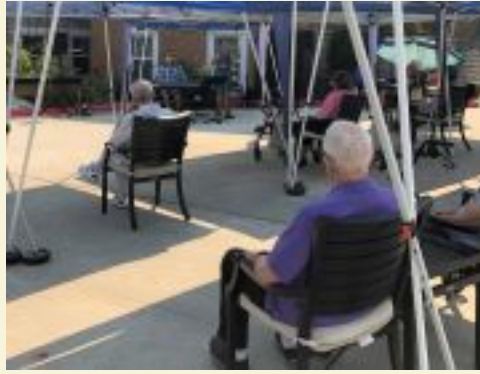
Happy Hour lives on!!